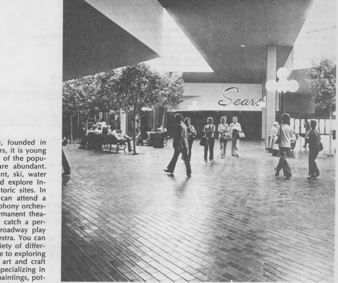
Newly built, the Coronado is the outstanding shopping mall in Albuquerque

Once you have seen Albuquerque and some of New Mexico, you'll know why the state is called the Land of Enchantment.