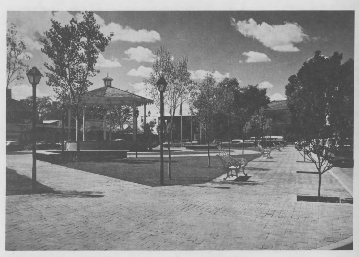
The Plaza of Old Town next to San Felipe Churchsurrounded by art galleries, craft shops, and fine restaurants

Most of New Mexico's world-famous attractions are within a day's drive in any direction. In addition to its easy access by auto, Albuquerque is a main stop on Amtrak. Its international airport is served by four major airlines.