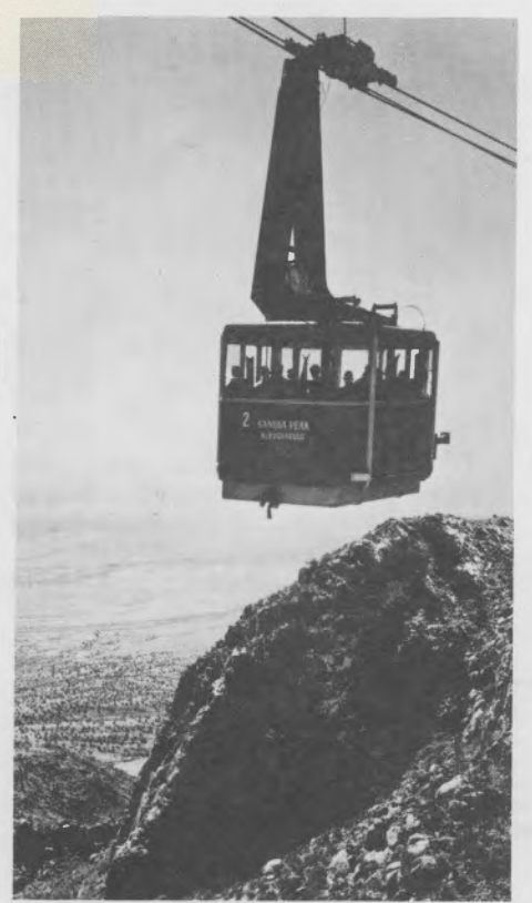
The Sandia Peak Tram rises almost a vertical mile in the Sandia Mountains to 10,378 feet elevation

Here are a few suggested activities for SWLA/MPLA Conference participants.