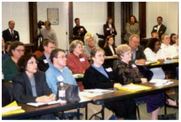
Participants in Oklahoma's First Amendent Congress.

Mountain Plains Library Association has been a great experience. My life has been enriched with new friends, continuing education opportunities, and a shared enthusiasm for libraries and librarianship.