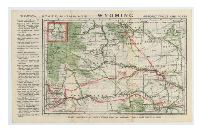
Wyoming State Highways, Historic Trails and Forts, circa 1924. University of Wyoming Libraries.

Access to the collections are provided through the project Website at <a href="http://digital.uwyo.edu">http://digital.uwyo.edu</a>. This resource is designed to be useful to the general public, students, teachers, and scholars. Users will be able to view and learn from Web-based exhibits on particular topics with pointers for further information to print and online resources. The Website also provides for image browsing and an interface to search University of Wyoming collections or across primary source materials from the Western Trails project participants.