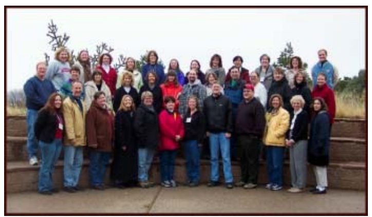
2003 MPLA Leadership Institute attendees.

Participants selected for attendance at this year's institute are listed on page 7 of this newsletter. After the institute this year's attendees will leave New Mexico with a new appreciation and understanding of their own strengths and weaknesses and their potential as leaders in MPLA and other professional milieus, including their own library organizations. This quality professional development opportunity is sure to change lives and libraries. Please be sure to encourage this year's participants to continue to development the leadership potential already recognized by the state committees who evaluated the many excellent applicants. Give these individuals and others opportunities to grow and to learn so that this next generation of library leaders will be even more dynamic and wonderful than the previous one has been!