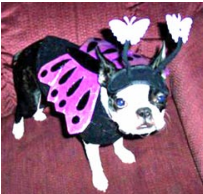
Sheba is ready to greet the kids in her beautiful butterfly costume.