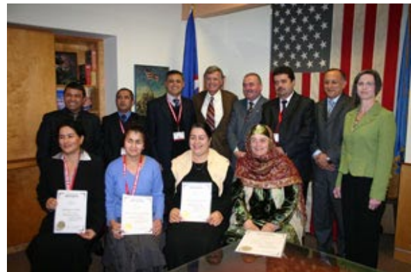
While in Lincoln the Tajikistan Librarian's met with the Mayor, and he made them honorary citizens.

The University of Nebraska-Lincoln Libraries and Lincoln City Libraries hosted a group of librarians and library managers from Tajikistan as they visited the Nebraska Library Commission, University of Nebraska- Libraries, Lincoln City Libraries, and library outreach sites. Their tour was sponsored by the USAID. The focus of the visit of the Tadjiki library managers, including the Director of the National Library was to observe American library modes of delivery, services, professional education, and staff development. The librarians stayed with American families, so that they could learn more about America in general.