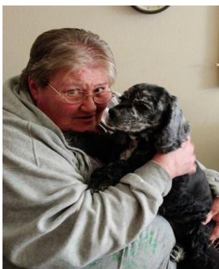
ADOPTION DAY: 10-24-2017