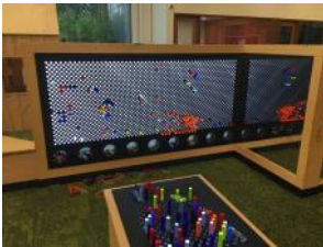
Brooklyn Park, Hennepin County Library System Minneapolis, MN

As part of the Library Journal Design Institute held in Minneapolis, South Dakota State Library staff library staff had an opportunity to tour four branches of the Hennepin County Library system: Webber Park, Brooklyn Park, Ridgedale, and Walker. Three branches are less than four years old, and Ridgedale was recently renovated. It was a chance to see current trends in library design and layout, including, for example, high ceilings, lots of windows, multipurpose spaces, and plenty of play area. Two fun touches were a giant “Lite-Brite,” and a wall panel which was a dry erase board.