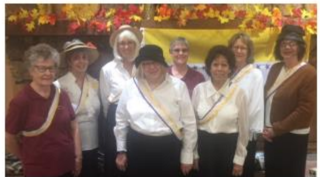
Members of the Friends of the Worland Library dressed as suffragists.

The Governor's Council for the Wyoming Women's Suffrage Celebration wants to encourage organizations and communities to participate in statewide celebrations through September 6, 2020.