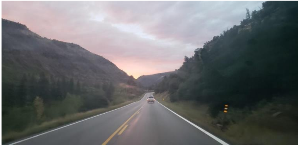
View from the road: Sunset behind the Norwood Canyon northwest of Telluride, Colorado

Anna Szczepanski travels to rural libraries as part of her role as a Colorado Library Consortium consultant. A few highlights from the road: