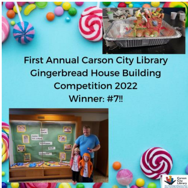
The Hansen family created a delightful candy and cookie train to run away with the win.