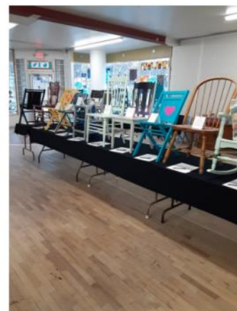
The Humboldt Friends of the Library (Bruun Memorial Library) held a unique "chair"itable fundraiser.