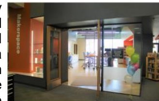
Grand Island Public Library Makerspace

As part of National Library Week, the Grand Island Public Library in Grand Island, NE hosted a special Makerspace Open House. Those who came received a tour of the Makerspace and see the amazing equipment available. The event was held in conjunction with the Grand Island Chamber of Commerce and co-hosted by the Grand Island Public Library Foundation.