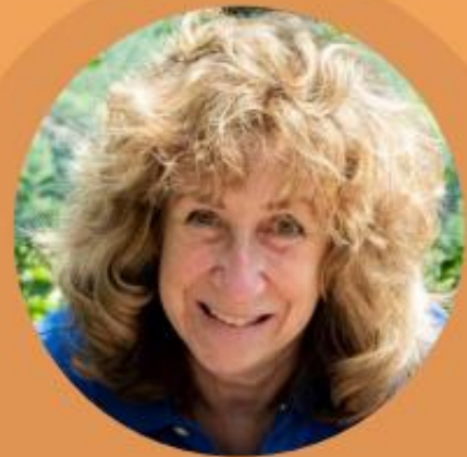
Sy Montgomery Author and Naturalist

Arizona Colorado Kansas Montana Nebraska Nevada New Mexico North Dakota Oklahoma South Dakota Utah Wyoming